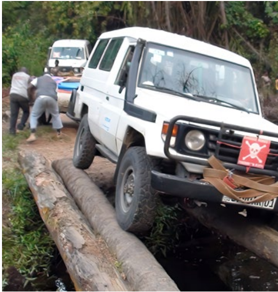
On route to the next site

tween the Congolese army and armed rebels or rebel groups. These conflicts are forcing many people to flee. The armed groups often deploy improvised explosive devices, and our employees need additional training in order to defuse them. A further difficulty is the poor condition of the roads, which impedes access to very remote villages and puts our vehicles under significant strain. We have to repair them constantly.